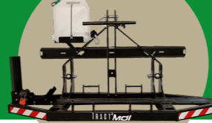
Faucet provided - 20 L