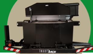
Lockable - 150 L