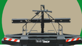
500, 750 & 900 Kg