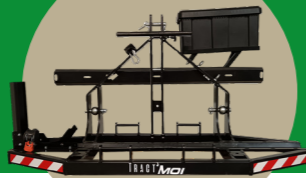
Lockable - 23 L